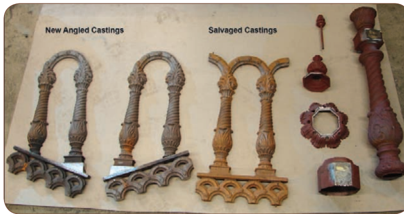
The original castings next to the new modified castings ready to be recast.

The individual castings had pins on the top and bottom and were sandwiched between a solid flat bar on top and angle iron on the bottom. The top rail and bottom angle had rods protruding from each end that inserted into holes in the base and top of the cast post.