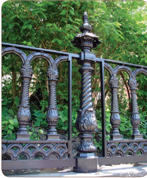
Newly recast post and new fence section after installation.

On the sloped retaining wall, we installed the angled sections by cutting the post base to the slope. The finite height of the casting and the increased