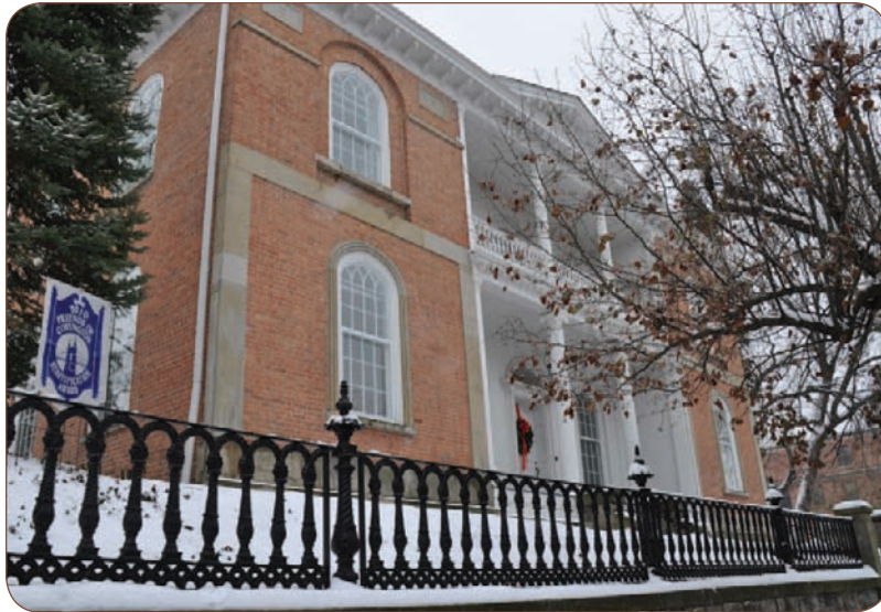
Carneal house fence after restoration, above. Note the replaced finial missing from the older photographs and the banner for one of the renovations many awards.

Carneal House circa 1940 with original fence, opposite page. An additional 150 linear feet was recast to accommodate the home's recent renovation and landscape expansion. Below , the fence style was originally designed and cast in the 1850s and was no longer in production. In this photo finials were already missing from atop fence posts.