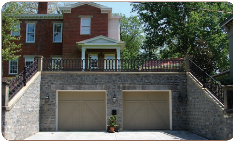
The new garage required the angled castings. The new sections and retaining walls blended seamlessly with the original wall and fence.

Understanding that we didn't need strength in the casting itself, we made the lengthened base and caps from 1/8-